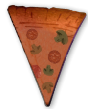
slice of pizza